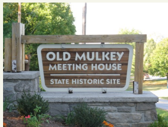
October 17, 2008 Tompkinsville, KY

Get more out of your membership join in future activities