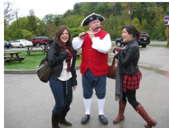
We like to have fun!