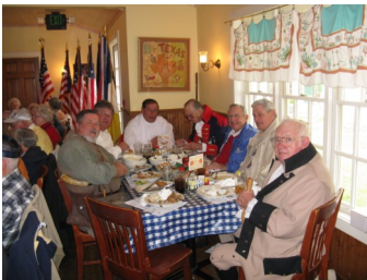
Chapter members having lunch at the Loveless Cafe