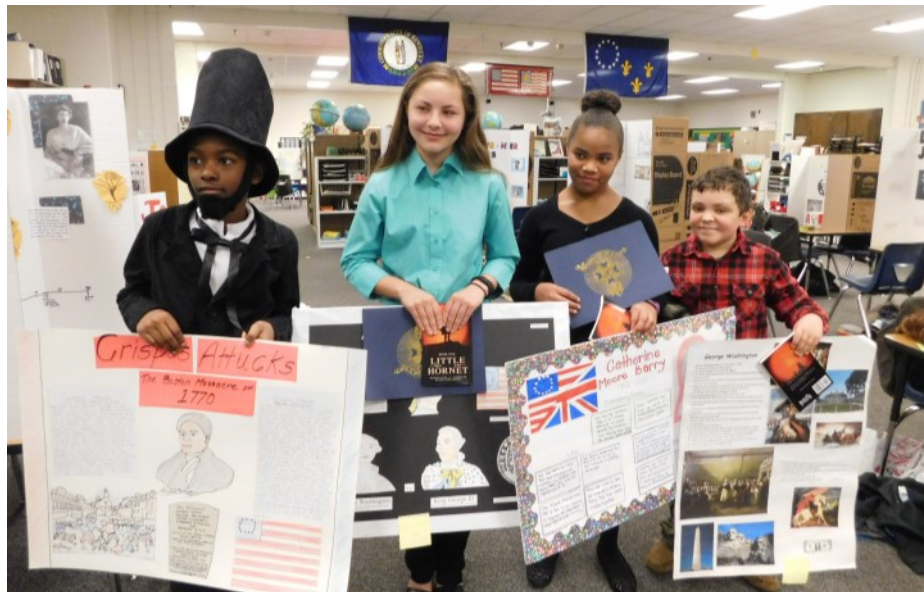
Top four finishers in SAR poster contest.