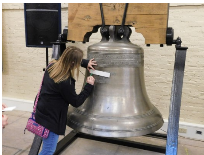
Student at Liberty Bell