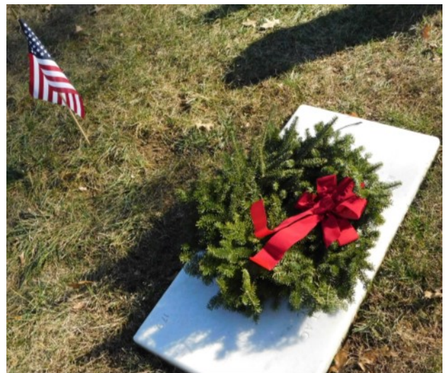
Veteran grave decorated