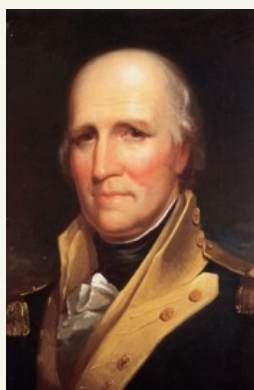
George Rogers Clark-Conqueror of the Old Northwest