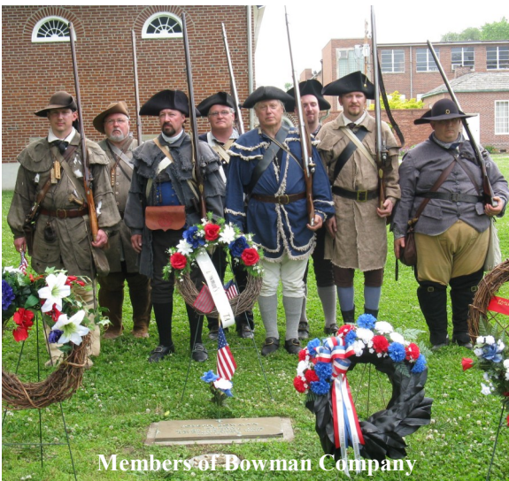
Members of Bowman Company