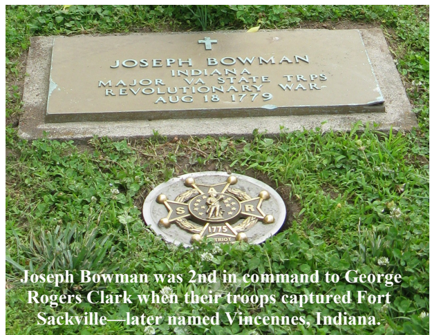
Joseph Bowman was 2nd in command to George Rogers Clark when their troops captured Fort Sackville—later named Vincennes, Indiana.