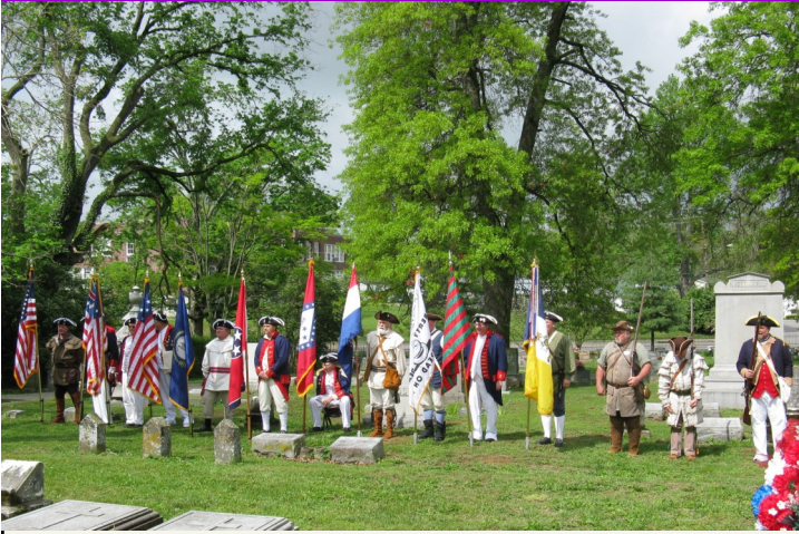
Versailles, KY: Patriot grave marking service for Judge Caleb Wallace. Judge Wallace was appointed to the court by Kentucky's first Governor—Isaac Shelby.