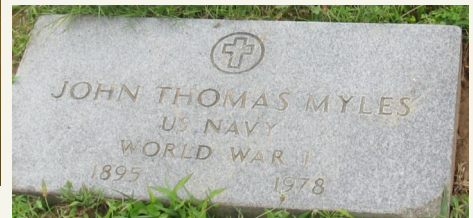
WWI marker and grave stone