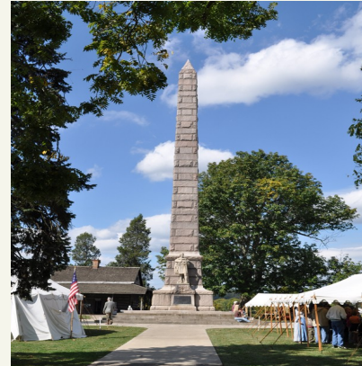
Point Pleasant Monument