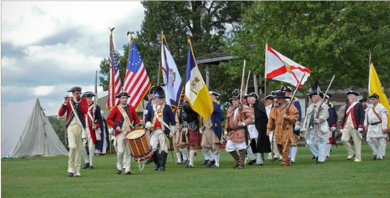
Color Guard at Point Pleasant.

Battle of Point Pleasant , in which Virginia militiamen led by Colonel Andrew Lewis defeated an Algonquin Confederation of Shawnee and Mingo warriors led by Shawnee Chief Cornstalk . The event is celebrated in Point Pleasant as the first battle of the American Revolutionary War , and in 1908 the US Senate authorized erection of a monument to commemorate Point Pleasant as the site of the first battle of the American Revolution. Most historians, however, regard it not as a battle of the Revolution but instead as a part of Lord Dunmore's War .