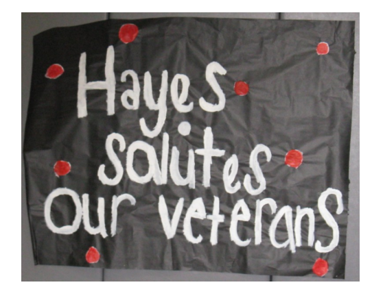
Sign made by the students.