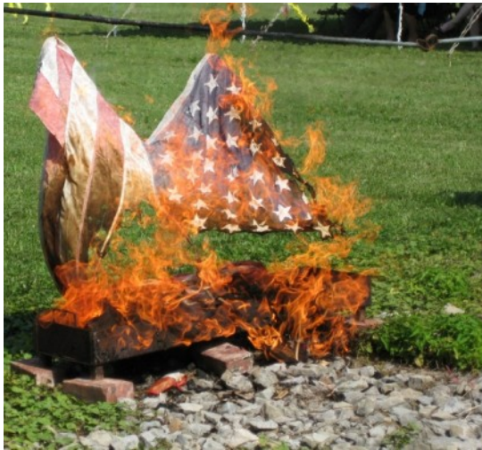
Flag being retired