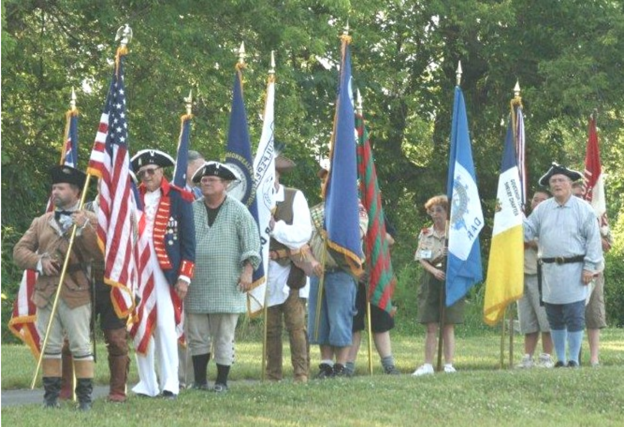
Color Guard at Cox's Station DAR Flag Retirement