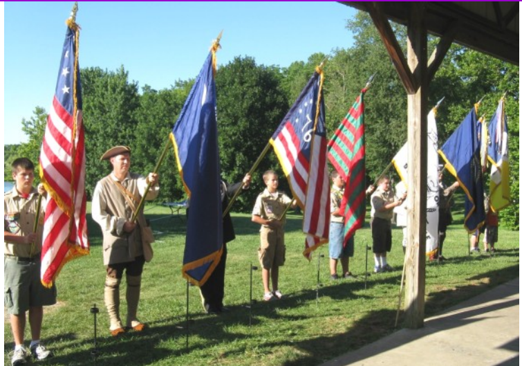
Combined Color Guard consisting of SAR, VFW and Boy Scouts present Colors and Standards