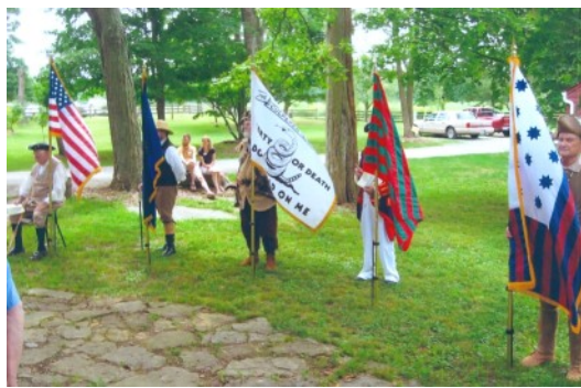
GIS presented Colors and Standards