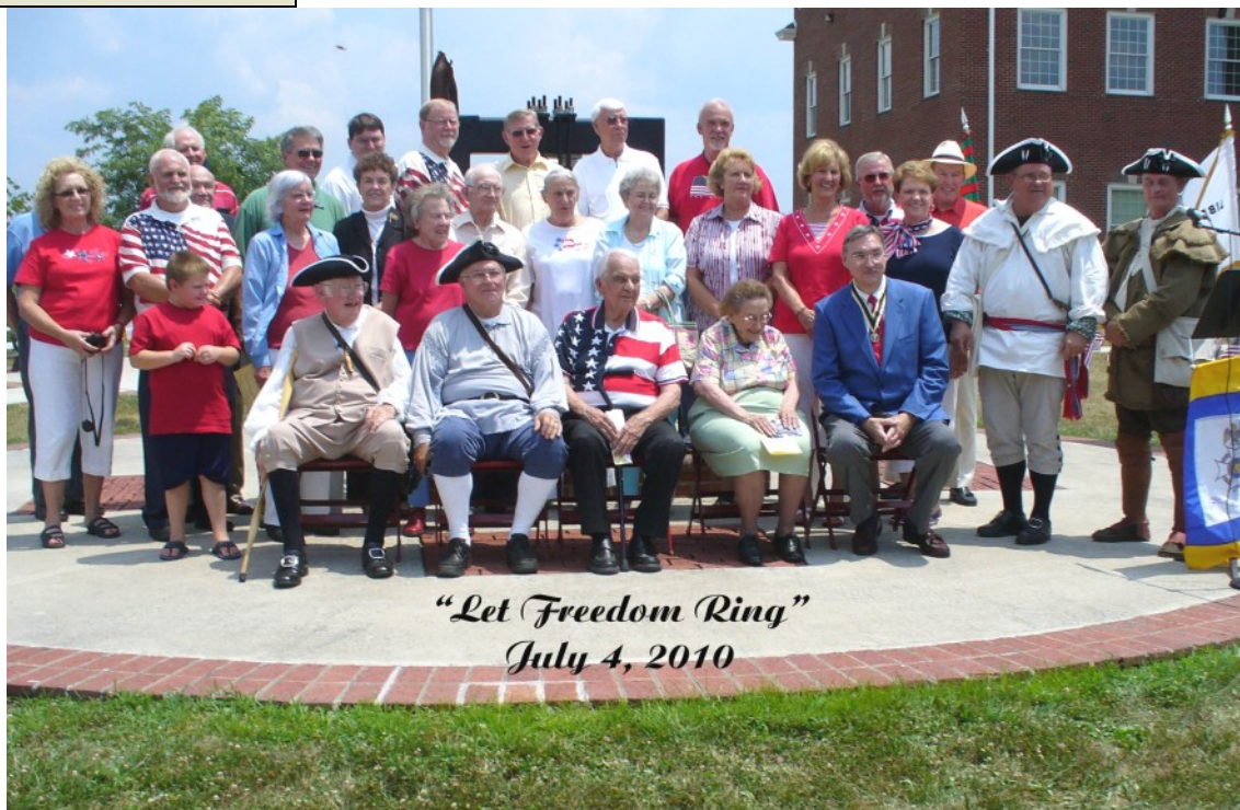
“Let Freedom Ring” July 4, 2010