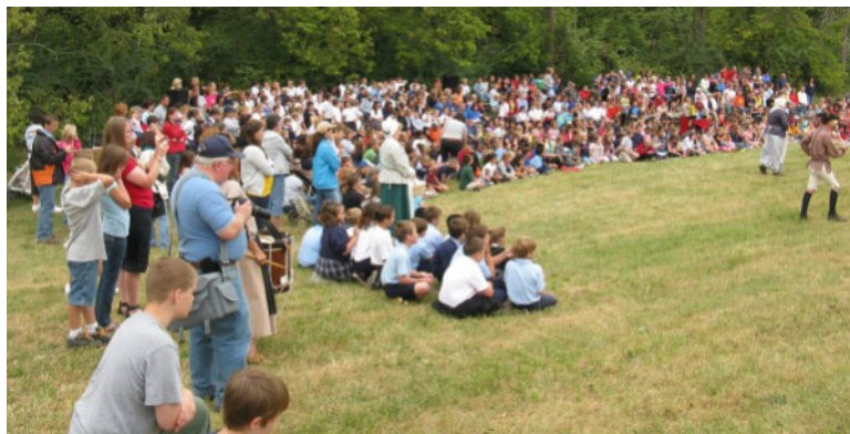
Students waiting for the cannon to fire and the Indian Raid.