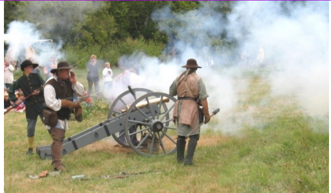
Preparing and firing the cannon.