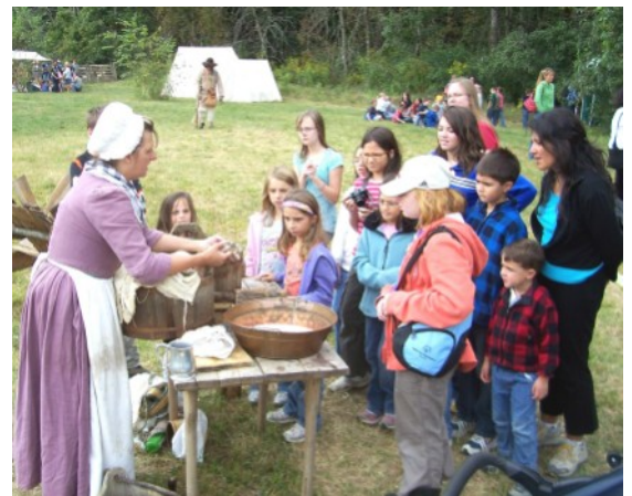
Different stations visited by the students included spinning wool, dying yarn and soap making.