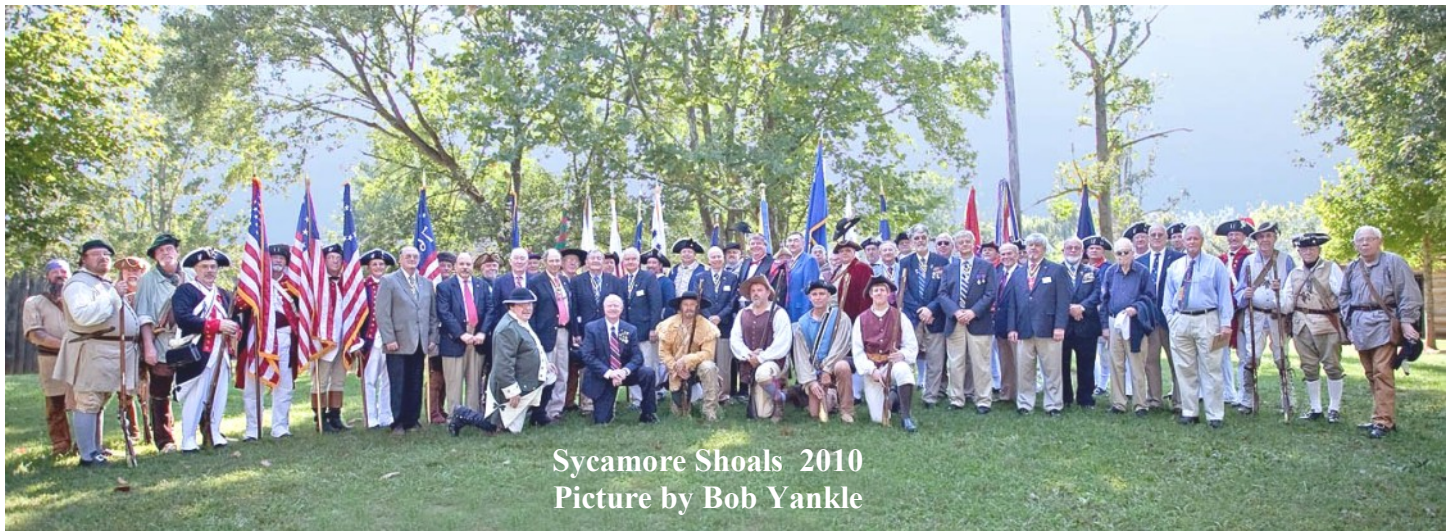
Sycamore Shoals 2010