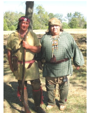
A few of the Indians that took part in the reenactment of the Long Run Massacre.

Mad Anne Bailey was at the event to tell her story. We hope to hear her again sometime!