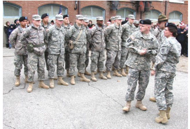
Soldiers who couldn't go home for Christmas were greeted by some patriotic citizens including members of the Gov. Isaac Shelby Color Guard.