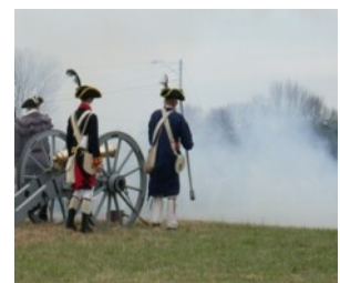
Guilford Courthouse Battle