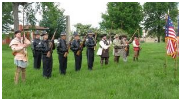
SAR & VFW shooters ready for gun salute.