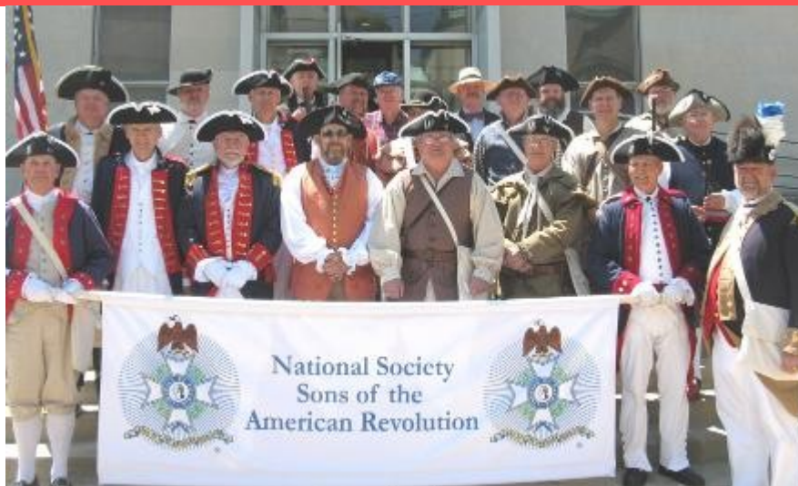
Compatriots from several states (Kentucky, Ohio, Texas, Georgia, Florida, North Carolina, South Carolina, Indiana and Missouri) pose at HQ before heading for the parade route.