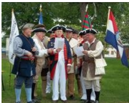
“The parting glass”