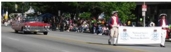
President General Sympton had a rough day riding the route in a 1959 Cadillac convertible.