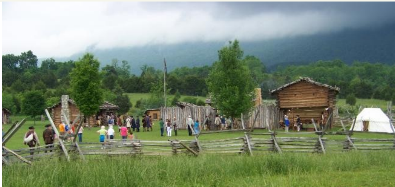
Martin's Station before the Indian Raid.