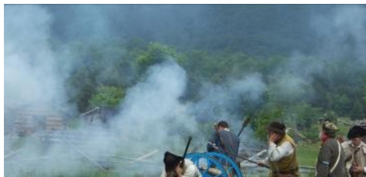
A cannon roars with the Colonel's answer.