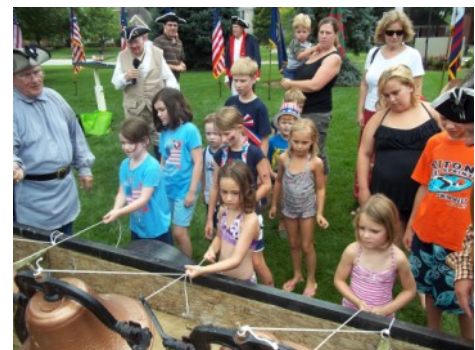
Pictures from the Fourth of July children's parade and the "Let Freedom Ring" bell ringing ceremony at the Owl Creek Community in Louisville..