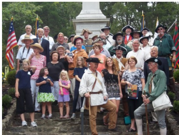
Group picture of C.A.R., DAR and SAR members at the Battle of Blue Licks memorial service.