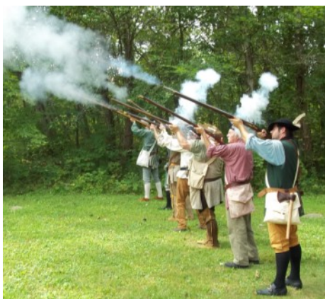
Black powder gun salute.