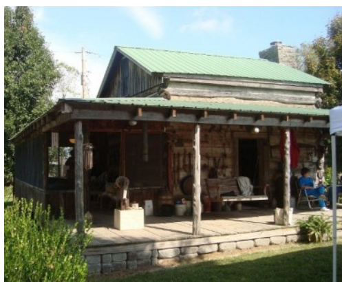
Robert Black cabin, Greensburg, KY