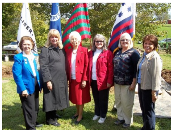
Daughters of the American Revolution