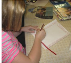
The students got to ring the Liberty Bell, write with a quill pen and make their own flag.