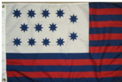
Guilford Courthouse Flag