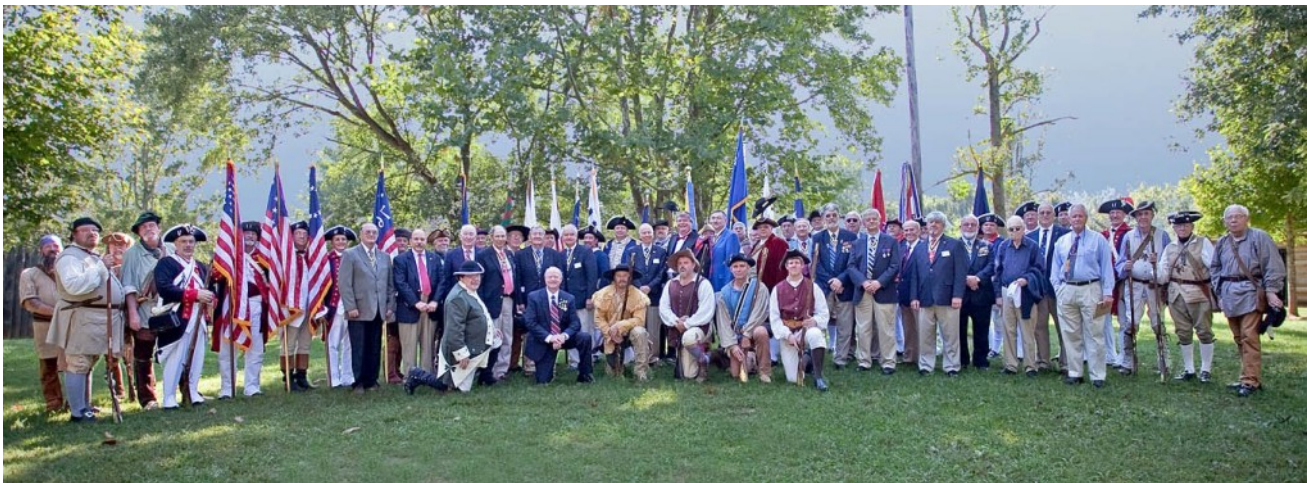
Compatriots at the 2011 Gathering at Sycamore Shoals