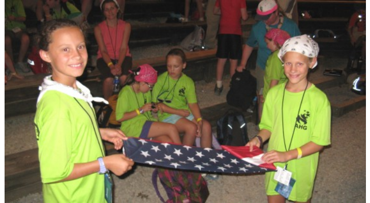
After watching our members fold the American Flag, some of the American Heritage Girls tried it themselves. They did quite well.