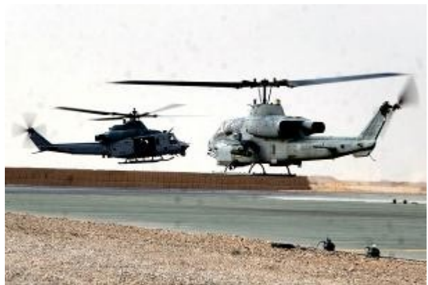
Thanks Marine Light Helicopter Squadron 169 for what you are doing!