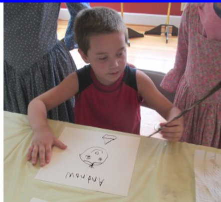
Learning how to fold the flag and writing with a quill pen were two of the activities.