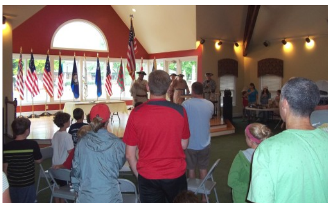
The pledge to the flag opened the ceremony.