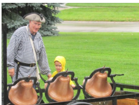
Bell ringing by one of the attendees.