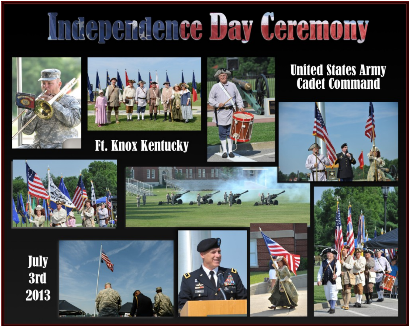
The cannons fired fifty one times--one for each state and once for our territories during the ceremony.

For the second year in a row members of the Gov. Isaac Shelby Chapter have taken part in the Independence Day ceremony at Fort Knox. The ceremony is tailored around several flags that we carry. For instance, when the Betsy Ross Flag is presented, the cannon shown below fires thirteen time--one for each of the original colonies. Then the Star Spangled Banner is presented and there is a cannon salute for both the fourteenth and fifteenth states--Vermont and Kentucky.