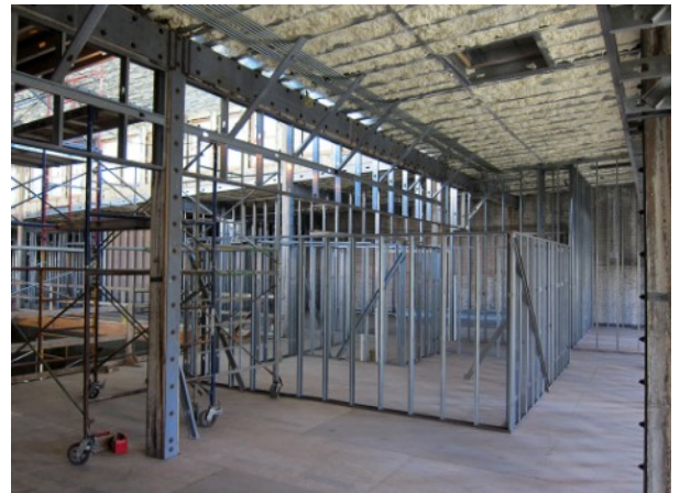
Framing Second Floor