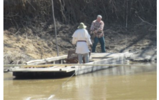
The pictures above are: A painting of the Crossing of the Dan, troops with a cannon ready to ward off any enemy troops and a small ferry waiting to transport members of General Nathanael Greene's Army across the Dan River.