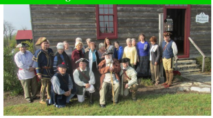
Group picture of SAR & DAR members.