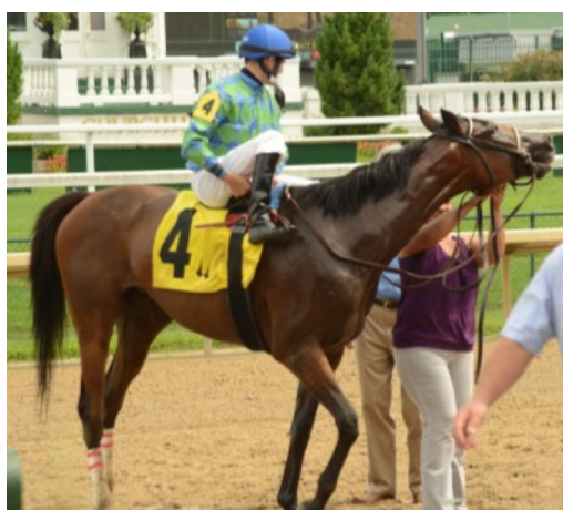
The winner of SAR's Patriots Cup