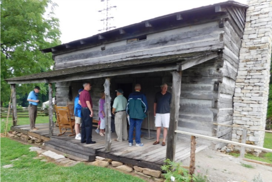
George Rogers Clark Cabin, Clarksville, Indiana