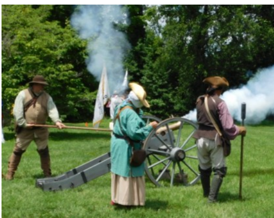
Painted Stone Settlers fire their cannon.