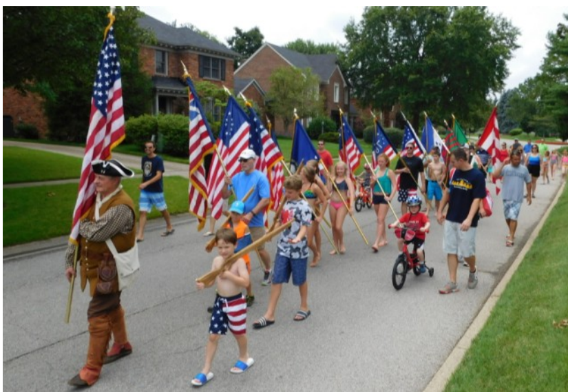
Children and adults marched in the Owl Creek Community parade. Afterwards, young and old signed their names on a copy of the Declaration of Independence.