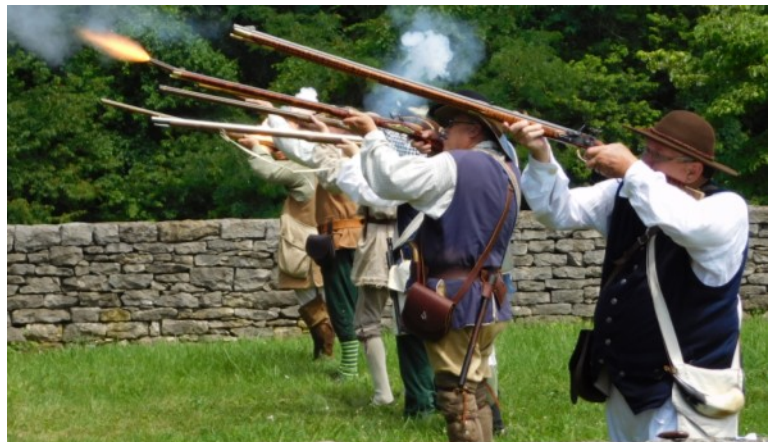
Black-Powder Gun Salute