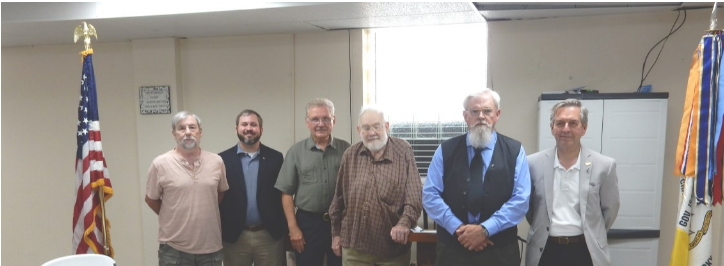
Below: New members receiving their rosettes.