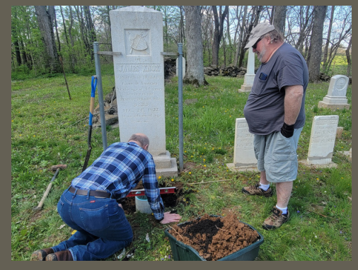
We need more dirt