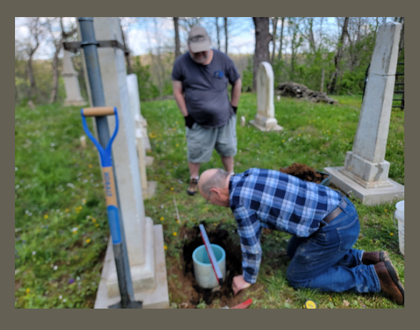
Its level already!!