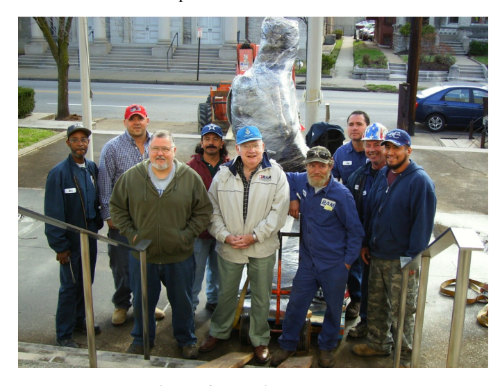
Watch video of the Minuteman move at: http://www.sar.org/news/minuteman.html