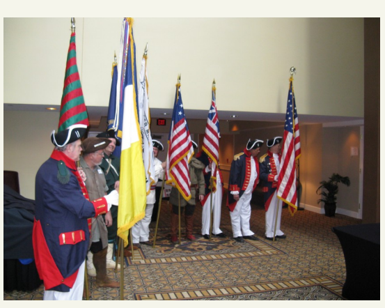
GIS Color Guard ready to present colors at State D.A.R. meeting.