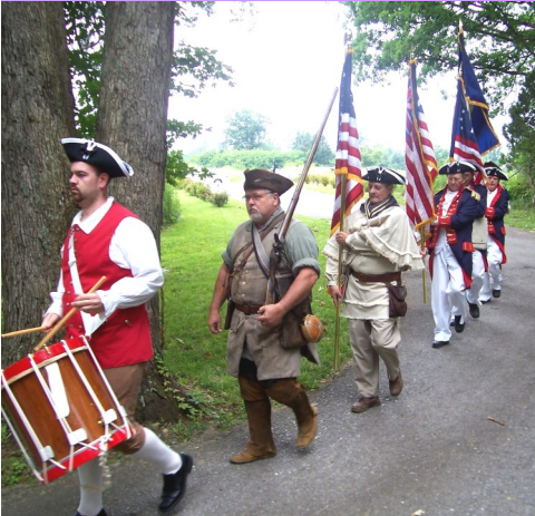
GIS Color Guard presents Colors