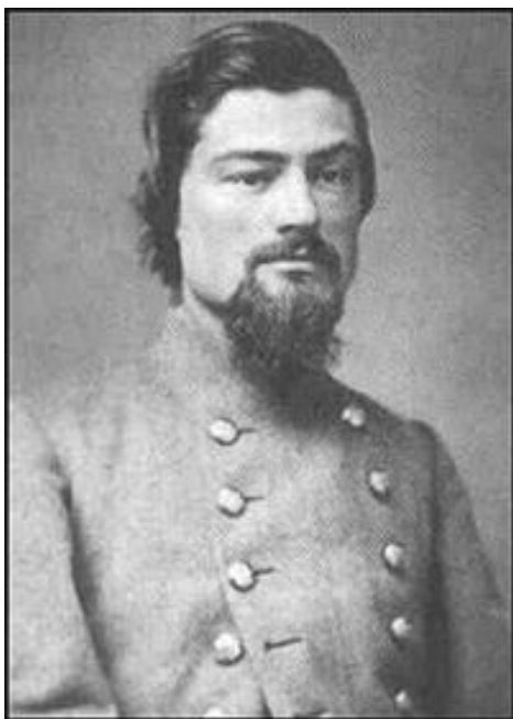
General Basil W. Duke