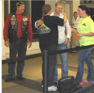
Soldiers returning from Iraq met at airport by members of the Gov. Isaac Shelby Chapter and members of the Middletown V.F.W.