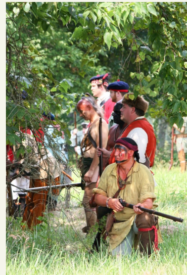
Battle of Blue Licks reenactment