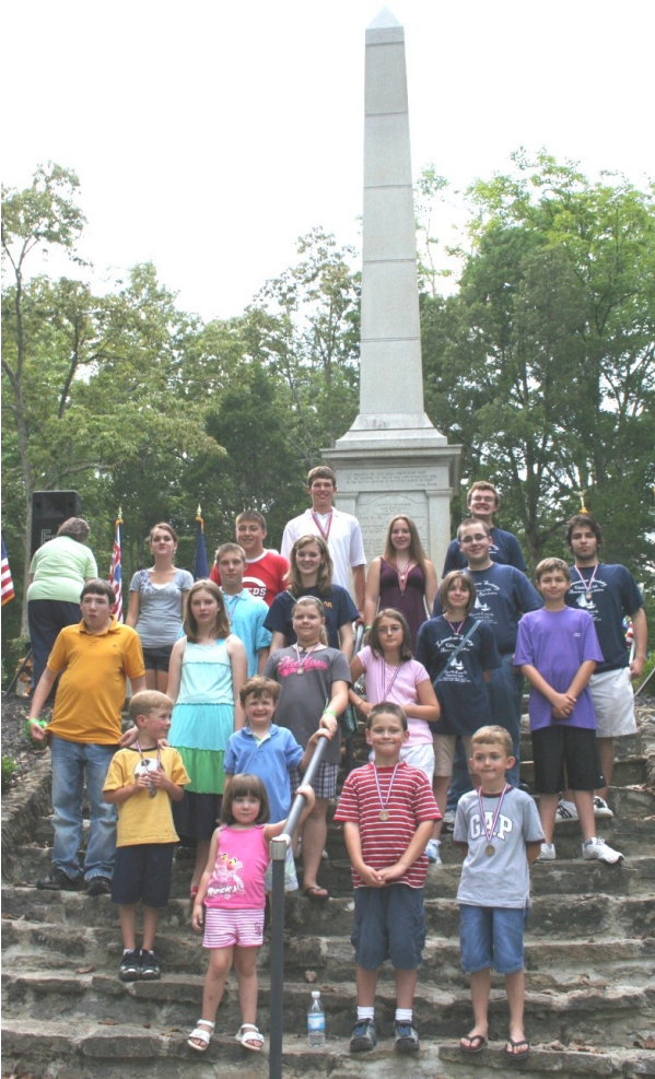
C.A.R. members from six Societies attended the Blue Licks Memorial Service. Thanks C.A.R.