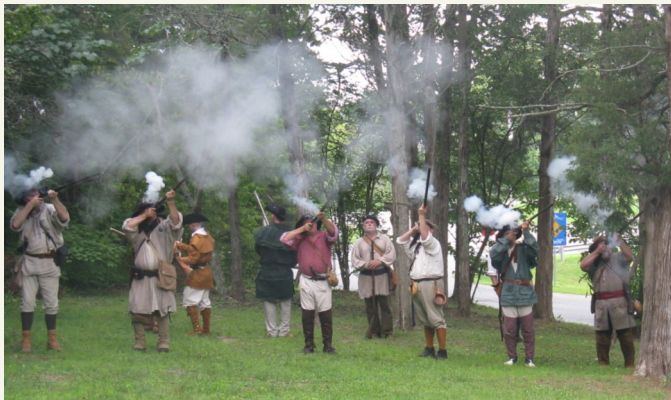
Gun salute at the Blue Licks Memorial Service