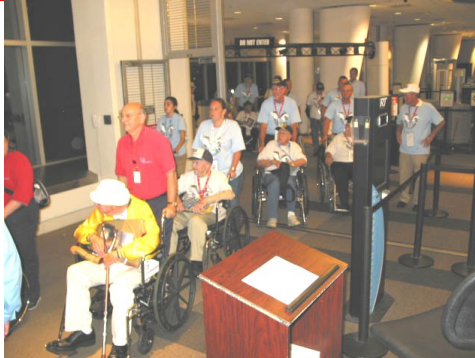
World War II Veterans as they arrive back in Louisville after visiting WWII Memorial