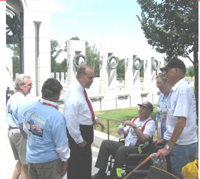
Former Senator Bob Dole talks with Veterans at WWII Memorial