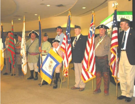
GIS Color Guard ready to greet WWII Veterans at Stanford Field.