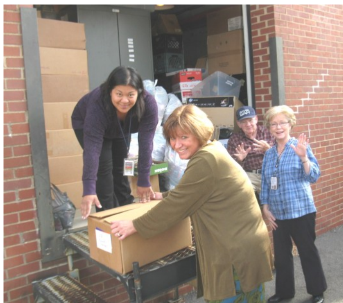
Service to Veterans: Chapter delivers a truck-load of books and other personal items to one of the eight V.A. hospitals we cover.