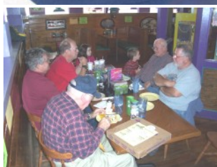
We are out of flags—let's go get some pizza!