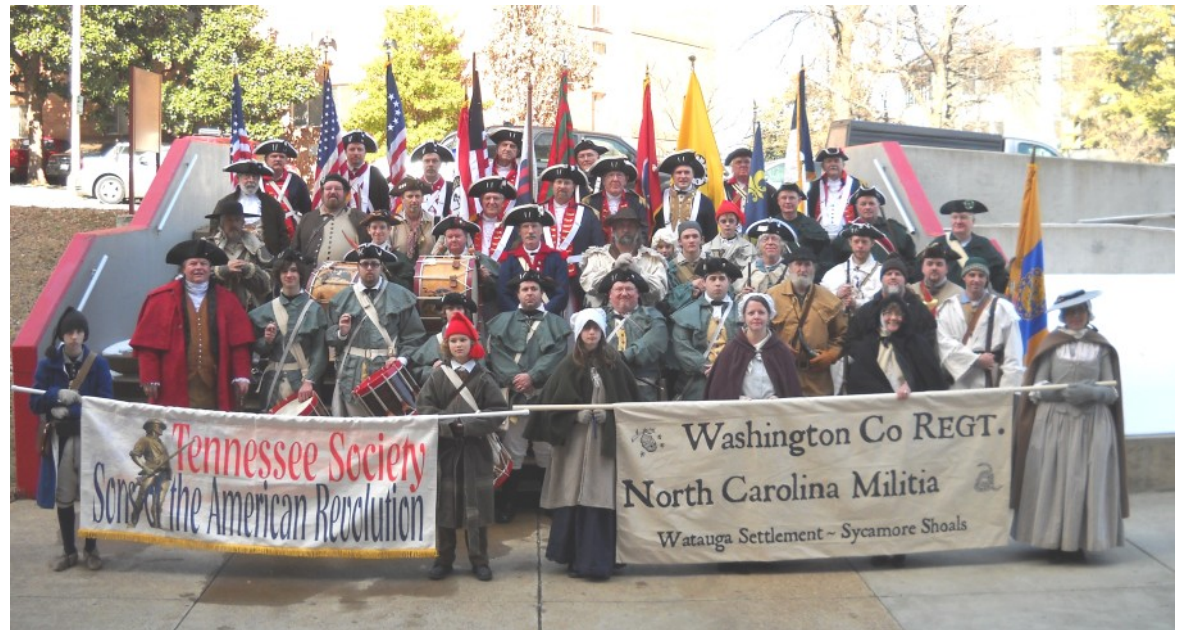
Group picture prior to the parade.