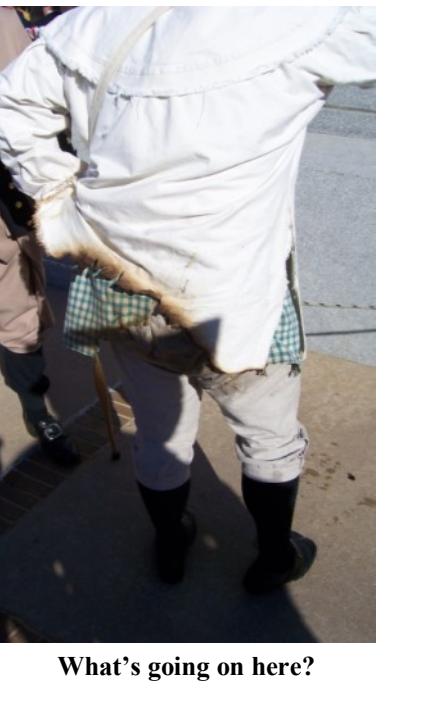
Don't venture into a Tory camp and don't back into an open flame heater.