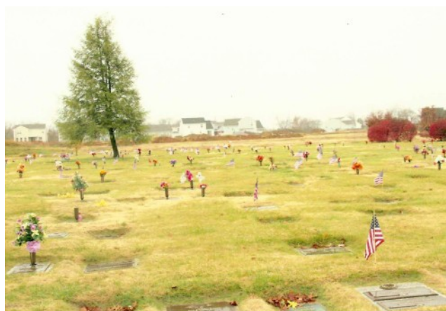
Joe Parish placed 55 flags on the military graves at Resthaven Cemetery for Veterans Day.