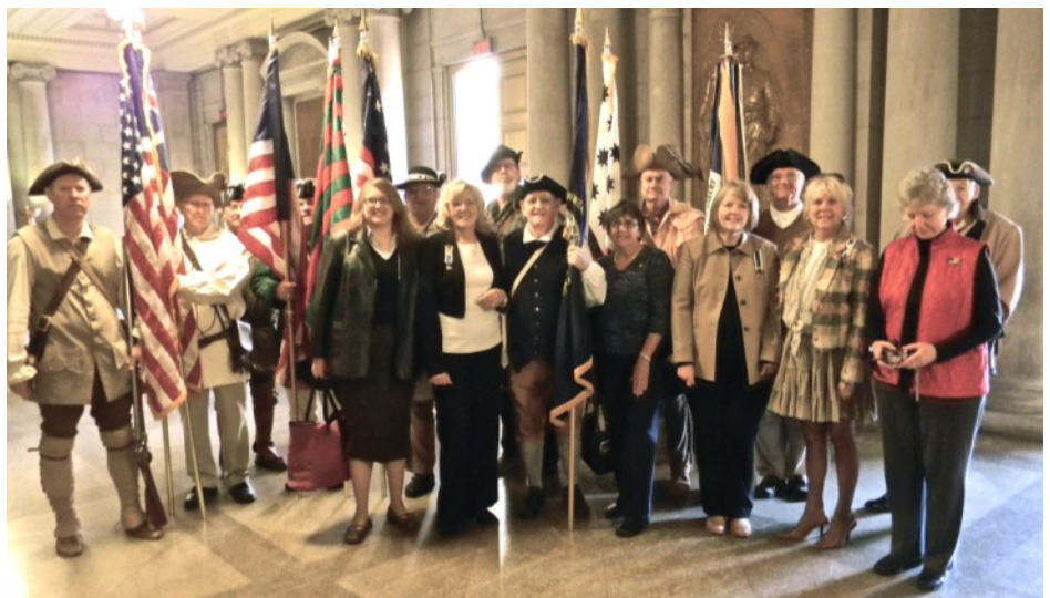
SAR & DAR at Naturalization Ceremony