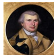
General Nathanael Greene