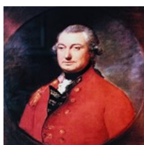
Lord Charles Cornwallis