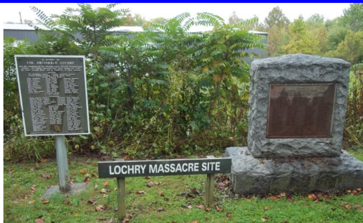
Monument at site of Lochry Massacre