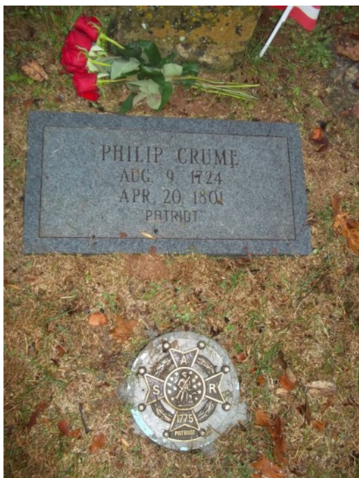
Grave stone and SAR marker.