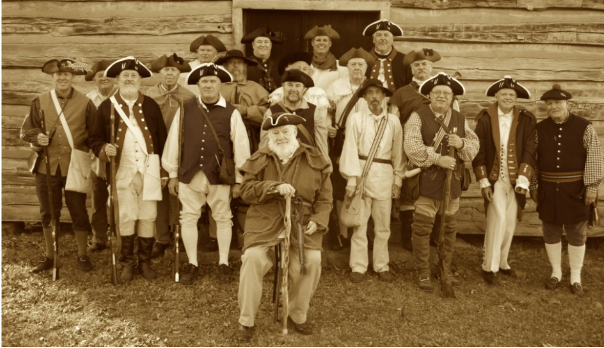
Group picture at Patriot Grave Marking Service in Muhlenburg County.

For updated Chapter Schedule check website at: gissar.org