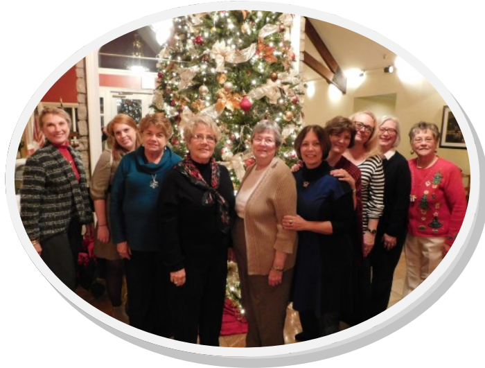
DAR members at chapter anniversary dinner.